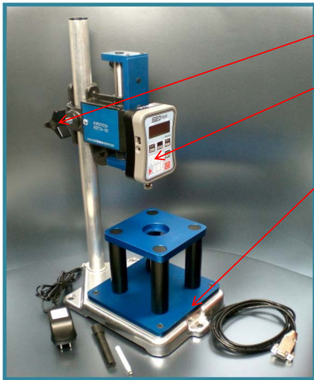
(SHOWN) RTFSTS-50 Test Stand

RUSSTECH ENGINEERING CO., INC. – 16 Technology Drive, Suite 111, Irvine, CA 92618 USA PHONE: (949).472.0880 – FAX: (949).472.1081 – WEB: www.russtechengineering.com – Email: russtengr@aol.com